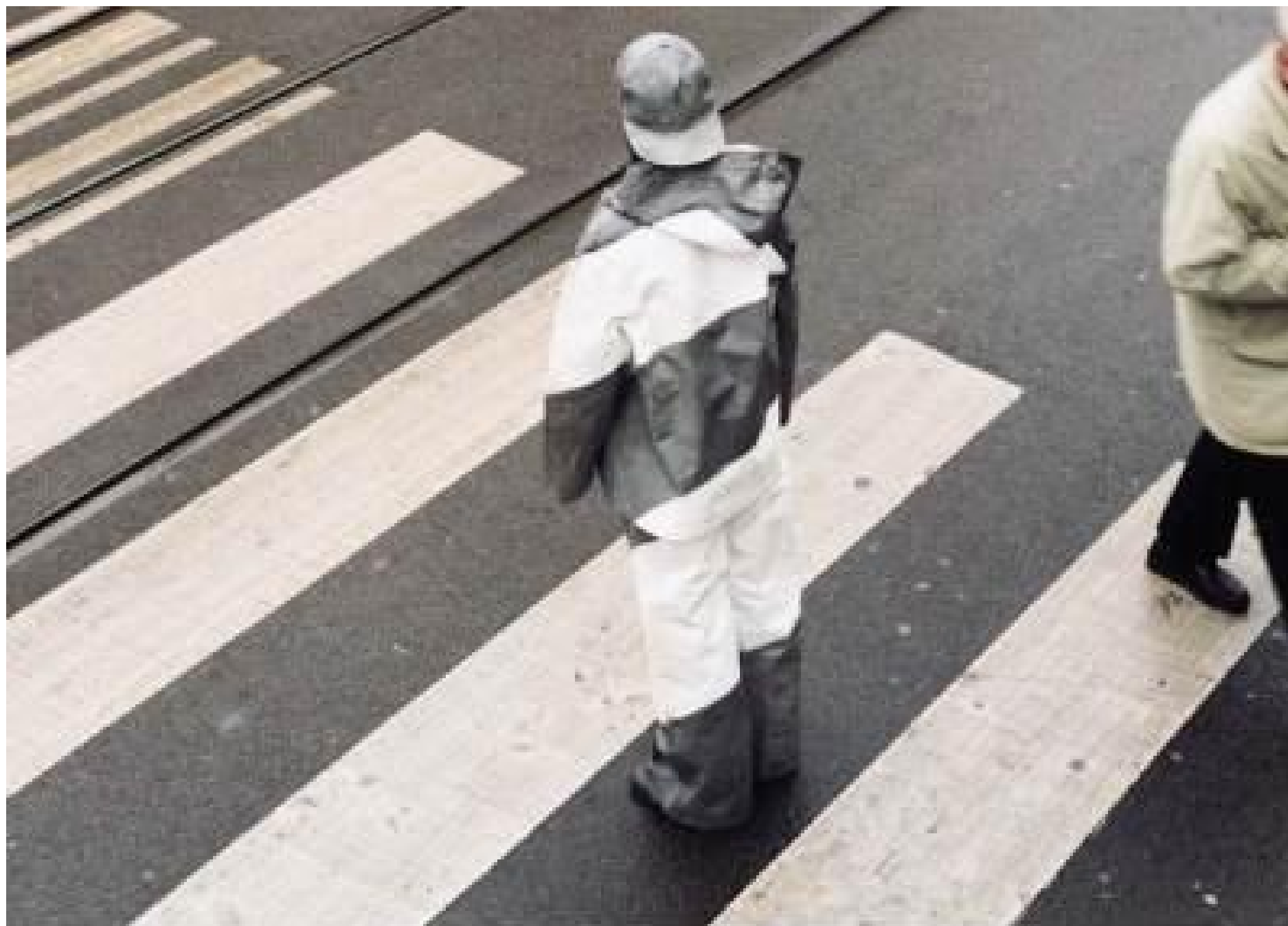
Désirée Palmen / Zebra / C-print / 2002 / 30 x 59 inches